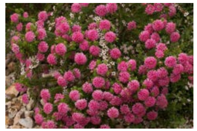
Pimelia ferruginea with Astartea fascicularis climbing through