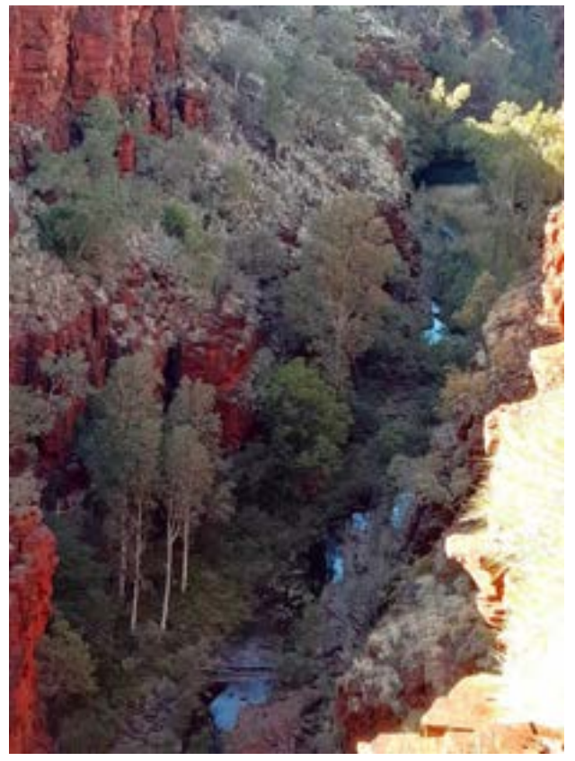
Knox Gorge