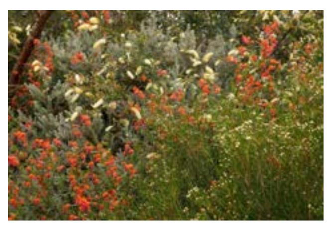
Chorizema cordatum, Grevillea flexuosa and buds of Chamelaucium 'Lemon Drops'