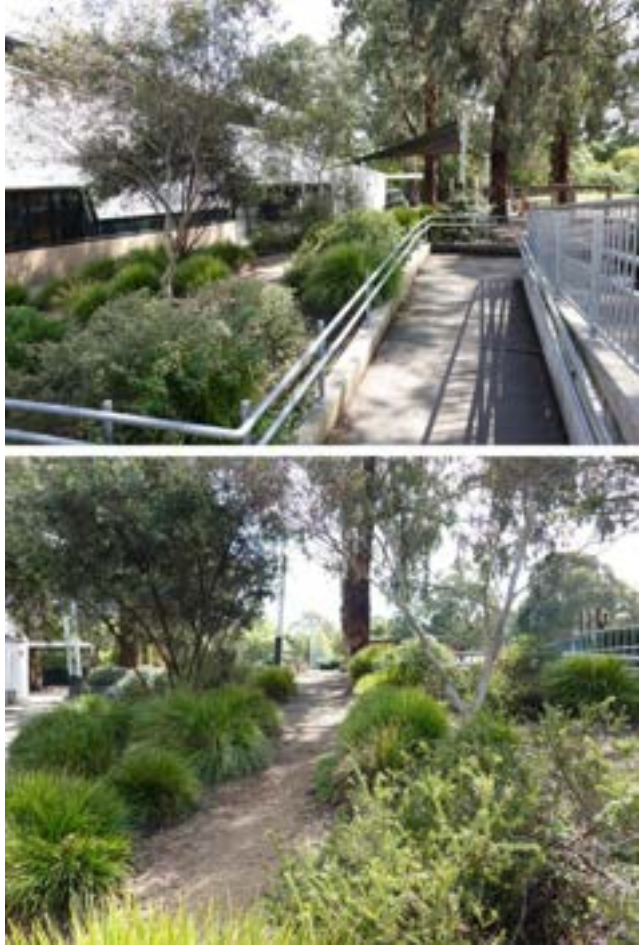
Accessibility is key at the school – both a regular path and an accessible path traverse this garden filled with 'pompoms' of tough lomandra.