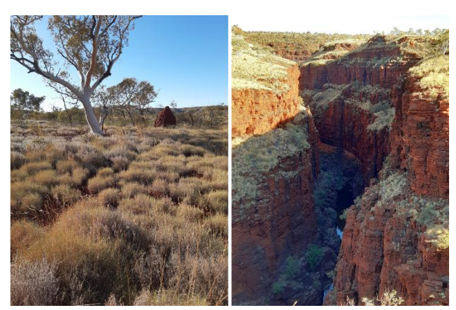
(L) Snappy Gum (R) Weano Gorge