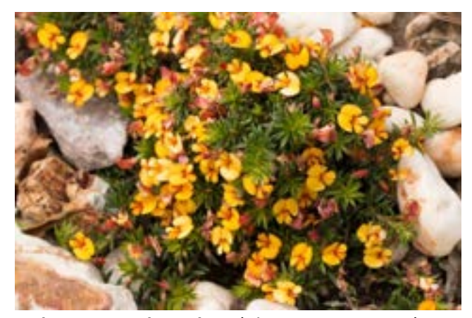
Pultenaea pedunculata