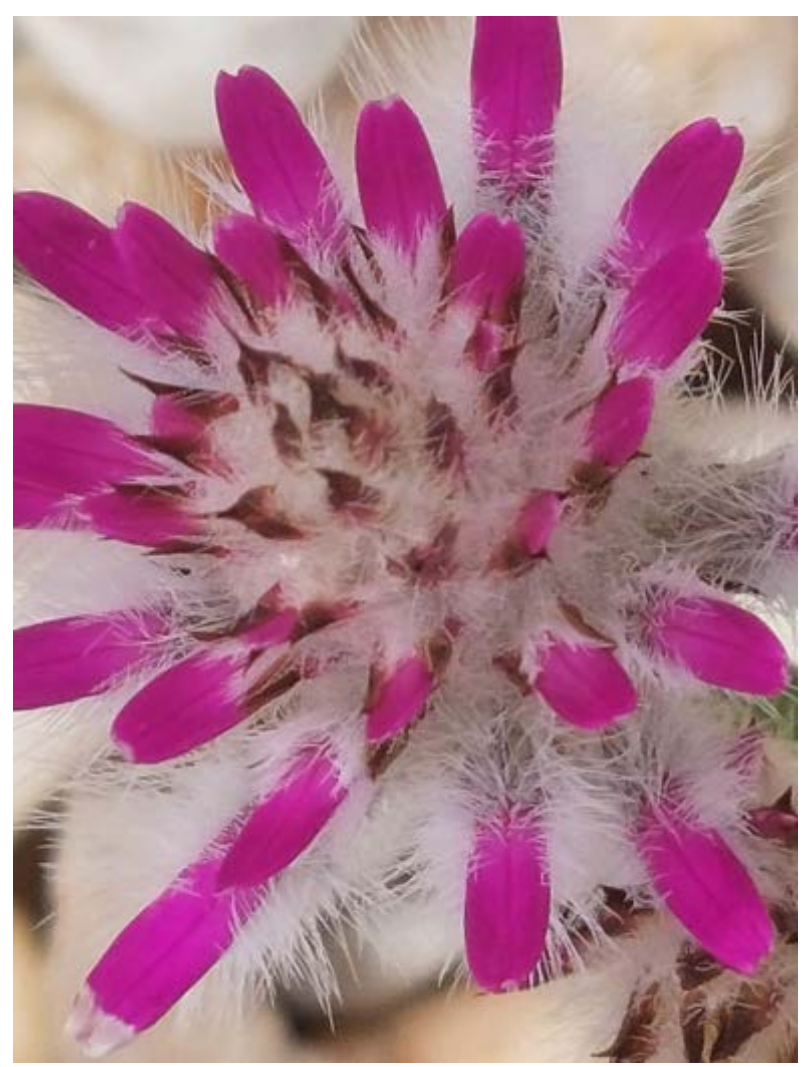
Ptilotus manglesi