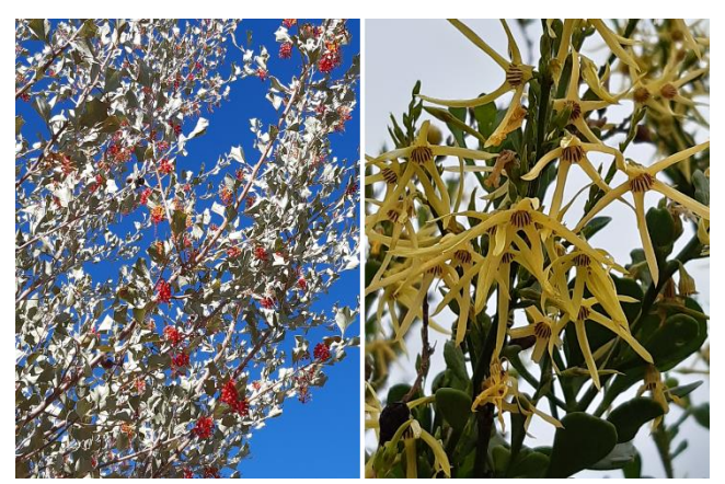
(L) Grevillea wickhamii (R) Anthocercis littorea