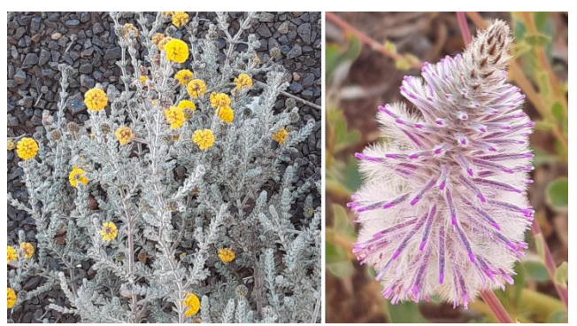
(L) Acacia adoxa var. adoxa (R) Ptilotus exalatus

Definitely one of the most stunning plants of the Pilbara region is Grevillea wickhamii with its very large showy red flowers. Interestingly Bev and I saw a yellow flowering form at Kings Park before we set out on our adventure. A most unusual plant, the ray flower Anthrocercis littorea , about 3m tall, was growing at the Pinnacles. Anthrocercis is an endemic genus to Australia with around 20 species half of which grow in WA.