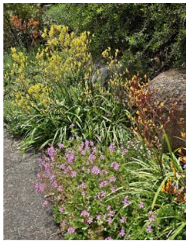
Summer colour in the garden

The next event on our calendar is a summer evening working bee at 5.30 pm to 7.30 pm at Knox Park Primary School with pizzas to follow. Hope to see you there. There are two more things organised for February – a propagation morning at Knox Park PS on Saturday 24 February from 10 am to noon, and an evening meeting on 28 February on Christmas and the Cocos Islands. The year is going to start with a flurry of activity! Please join us.