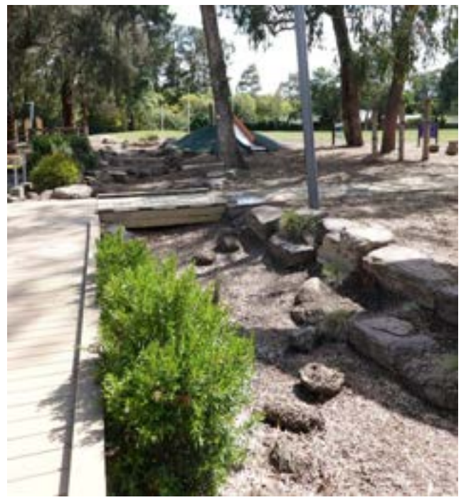
A dry river bed is both aesthetically pleasing and takes care of stormwater.